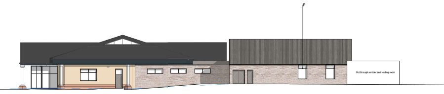
PROPOSED EXTENSION NORTH ELEVATION 1:200 at A1