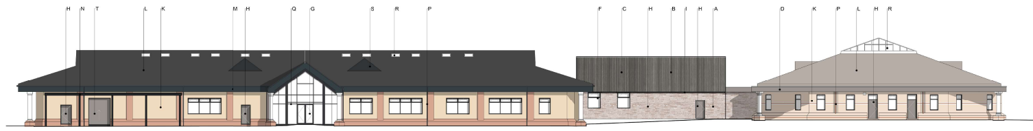
PROPOSED EAST ELEVATION 1:200 at A1