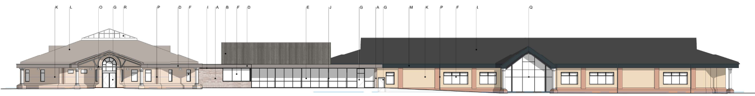
PROPOSED WEST ELEVATION 1:200 at A1