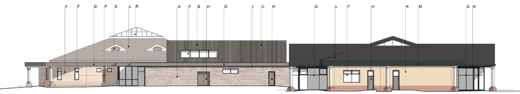
PROPOSED SOUTH ELEVATION 1:200 at A1