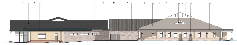
PROPOSED NORTH ELEVATION 1:200 at A1